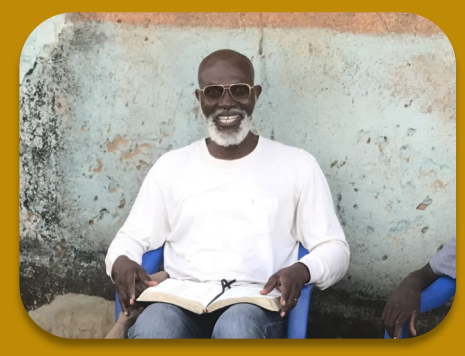
TEACHING AND WARNING ALL MEN

TAKING THE GOSPEL, CARE AND COMPASSION TO WHERE IT IS NEEDED THE MOST.