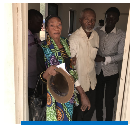
A wife seeking help for her blind husband. His surgery was successful.